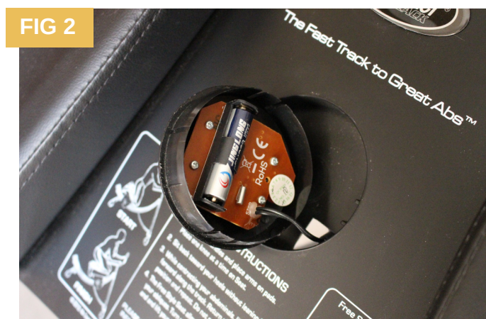
BACK OF FACEPLATE